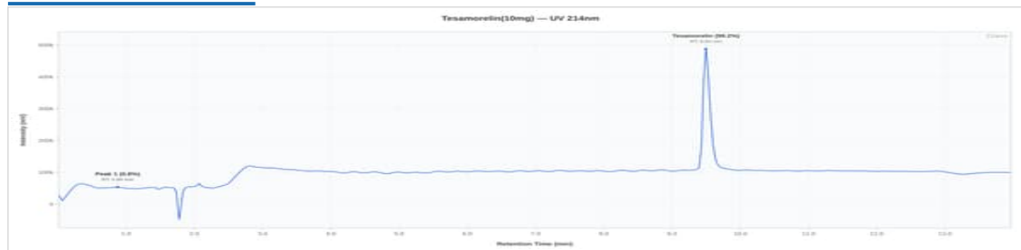
Tesamorelin 10mg 10mg - Black Cap: UV Chromatogram