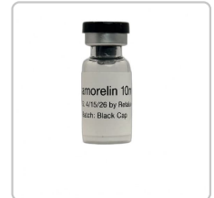
Tesamorelin 10mg 10mg - Black Cap